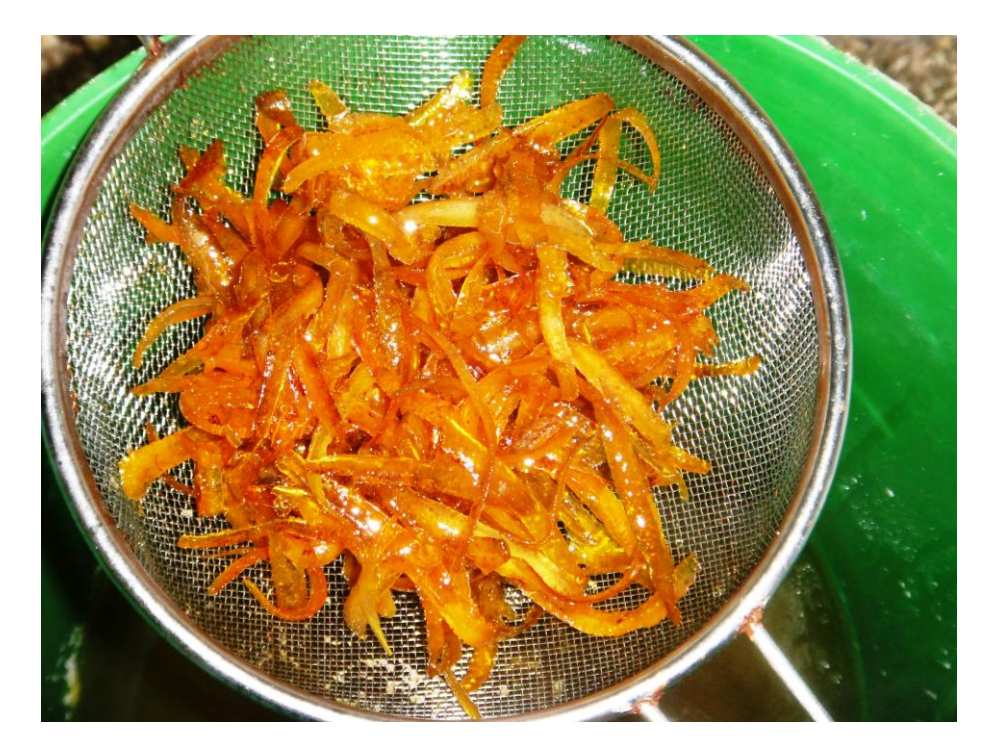
Take drained rinds and drop into sugar. Recommend using a baking sheet with sides for this. A plate will be quite cramped.