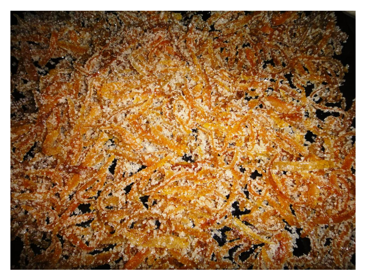
Thoroughly coat the peels with sugar. Roll in sugar until a bit cooler, then drop onto paper towels to cool the rest of the way. Store in an airtight container.