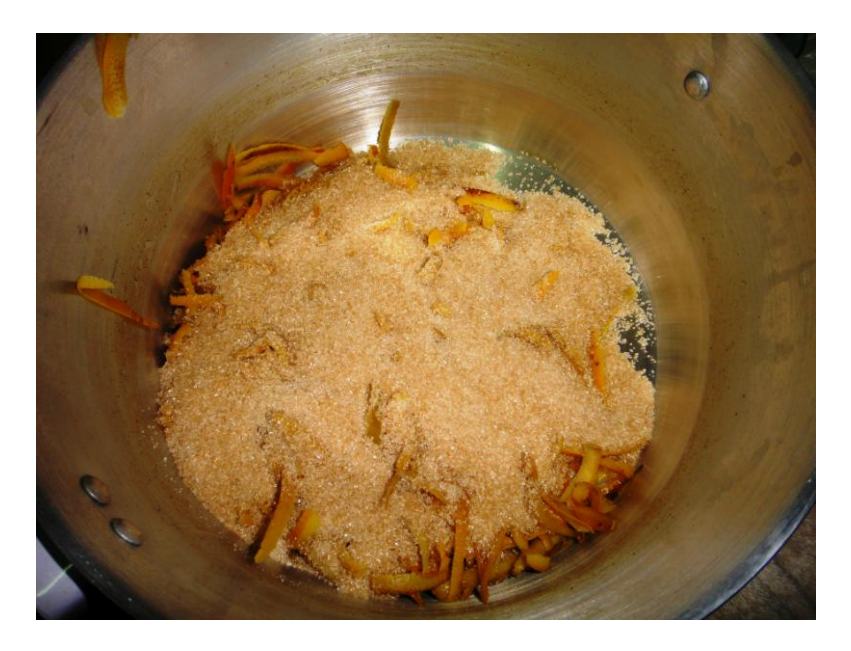
Heat the mixture while stirring until the mixture boils and comes to soft candy stage. A candy themometer will help achieve this important end point temperature of the mixture.

Add sugar and sufficient water to dissolve the sugar and cover the peel.